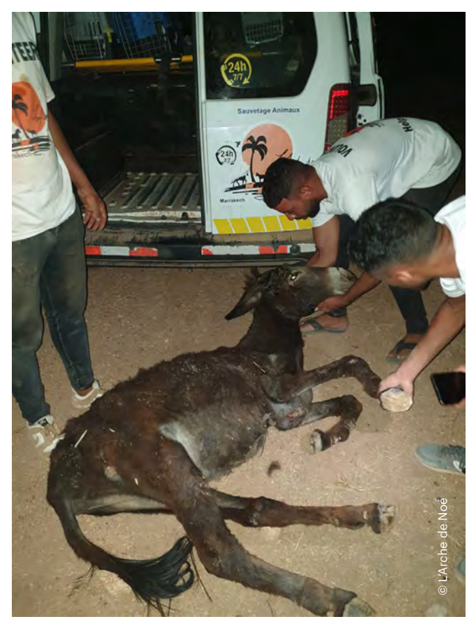
A donkey rescued from the devastating earthquake in Morocco and treated for serious injuries by the L'Arche de Noé team.