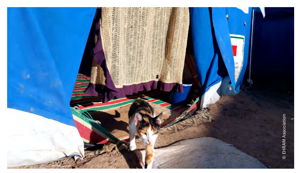
A stray village cat.