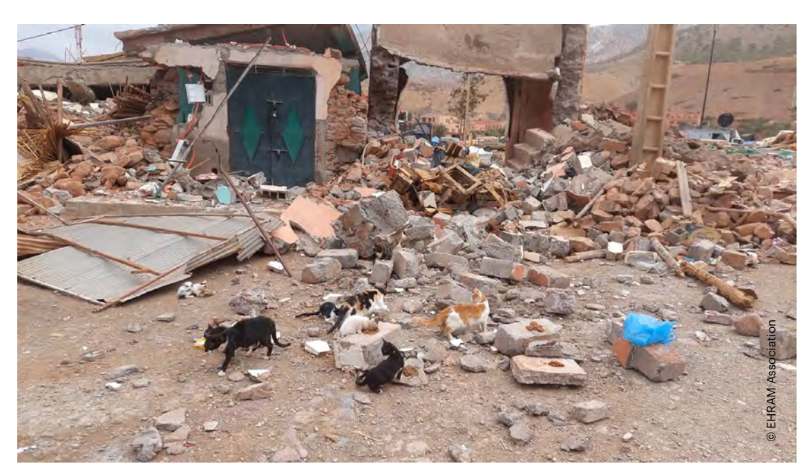
Cats amongst the rubble following the 6.8 magnitude earthquake.