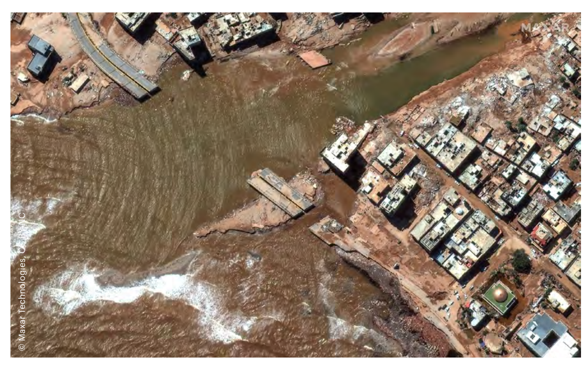
Satellite image of coastal road after floods in Derna, Libya on September 13, 2023.