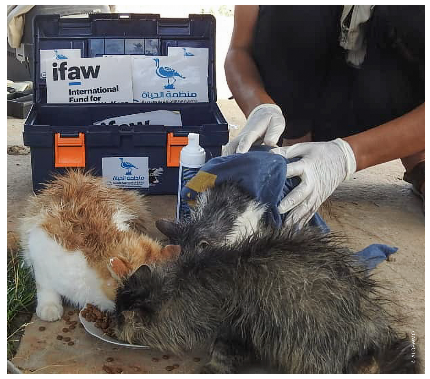
Team members from Alhaya Organization for the Protection of Wildlife and Marine Organisms treat a cat impacted by flooding in Libya.

The results of the field assessment found that the most notable damage to the areas was the contamination of natural springs, bodies of water, and seawater with waste petroleum due to the destruction of fuel stations and storage facilities. Responders reported that thousands of livestock perished and those that survived required veterinary care and supplemental fodder; over 1,100 beehives were lost, impacting beekeepers and the surviving flora that depends on pollination; and that the Egyptian turtle habitat south of Derna had been impacted by the storm surge and pollution debris. It was also noted that the soil erosion deeply impacted orchards, fruit and vegetable farms.