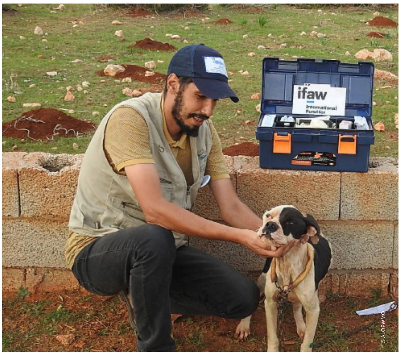
A team member from Alhaya Organization for the Protection of Wildlife and Marine Organisms treats a dog impacted by flooding in Libya.

After hearing the news of the collective damage within Libya, our colleagues located in the Middle East and North Africa office reached out to their contacts to see how IFAW could be of assistance. Both AOPWMO & The Libyan Wildlife Trust came as recommendations as they are both members of the International Union for Conservation of Nature (IUCN) and are well-respected by national government authorities.