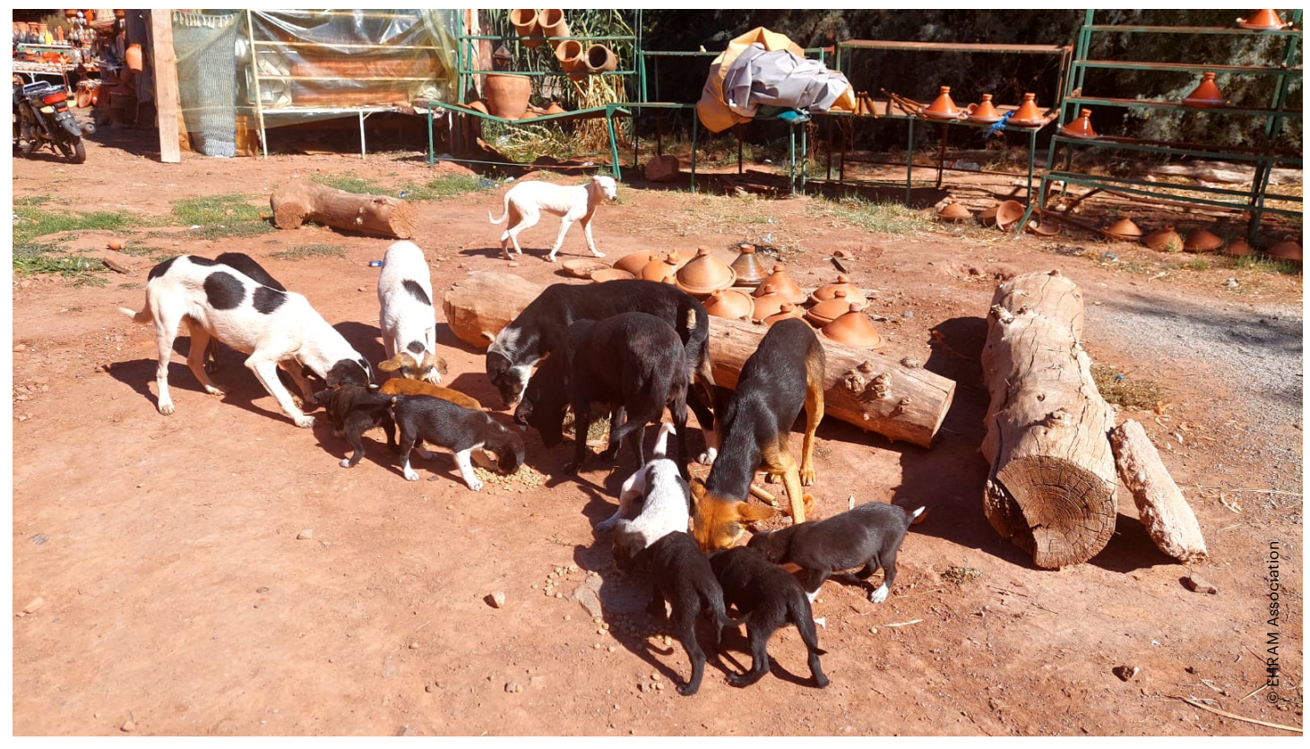
Group of dogs being fed.

After the earthquake EHRAM Association contacted IFAW for assistance. After careful vetting, and a recommendation from an animal welfare organization which had worked with them outside of a disaster capacity, we determined that their work in supporting roaming and abandoned domestic animals was reputable and impactful.