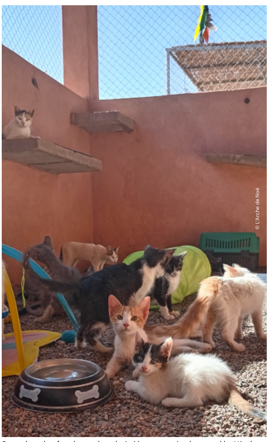
Several weeks after the earthquake in Morocco, animals treated by L'Arche de Noé were recovering well in the clinic's care.