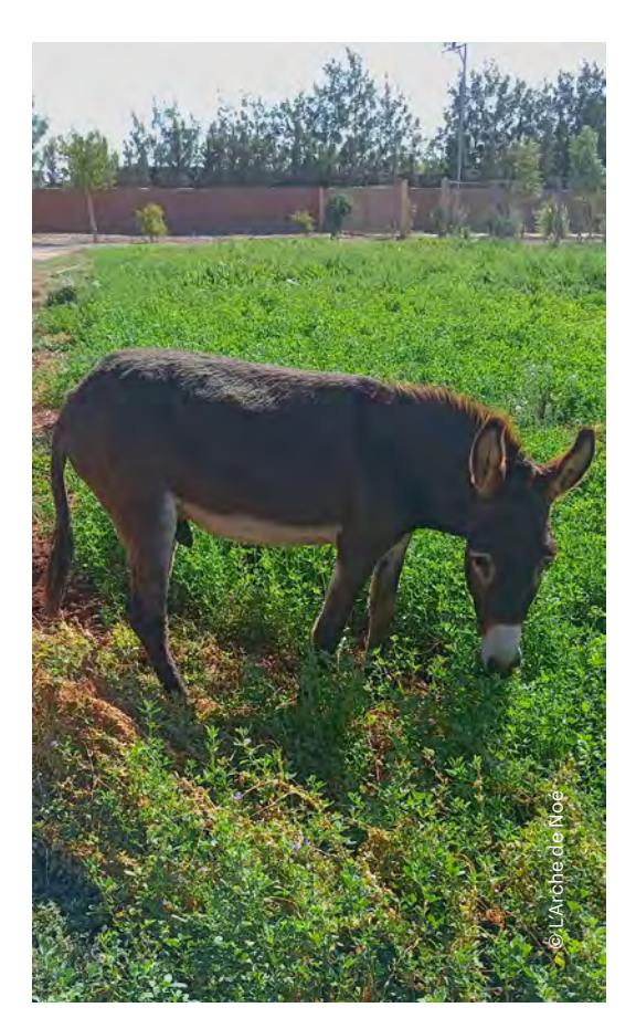
Several weeks after the earthquake in Morocco, animals treated by L'Arche de Noé are recovering well in the clinic's care.