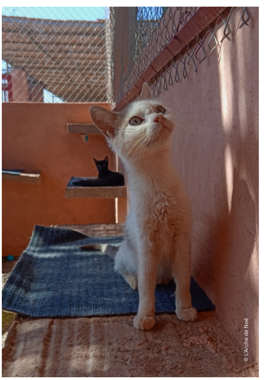
Several weeks after the earthquake in Morocco, animals treated by L'Arche de Noé were recovering well in the clinic's care.

Several dogs and cats received lifesaving veterinary services, including one tumor removal, two eye surgeries (one dog, one cat), and several treatments for infections. Those animals needing additional care will continue to live at the shelter while the healthier animals will be released back to their original neighborhood.