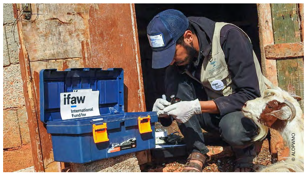
A team members from Alhaya Organization for the Protection of Wildlife and Marine Organisms treats a goat impacted by flooding in Libya.